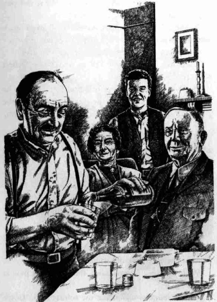
'Let's have some whisky,' old Mr White said.

Old Mr White did not stop. 'But your stories were