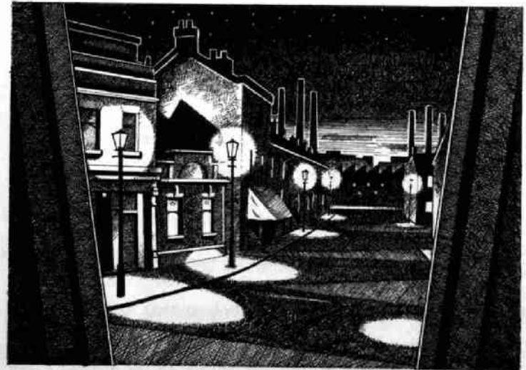
The road was dark and quiet.

At the same time Mr White took the monkey's paw