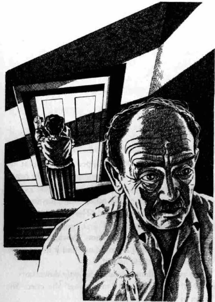
"The paw!" Mr White thought. "Where's the monkey's paw?"

'Nothing! Go to sleep again!' her husband answered. But Mrs White listened – and the noise came again.