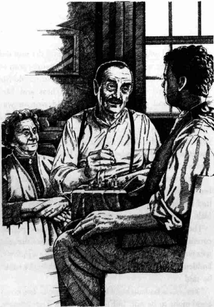
Old Mr White and his son played chess.

'Yes, that's right. He's coming at about seven o'clock,' the old man said. 'But perhaps this rain . . .'