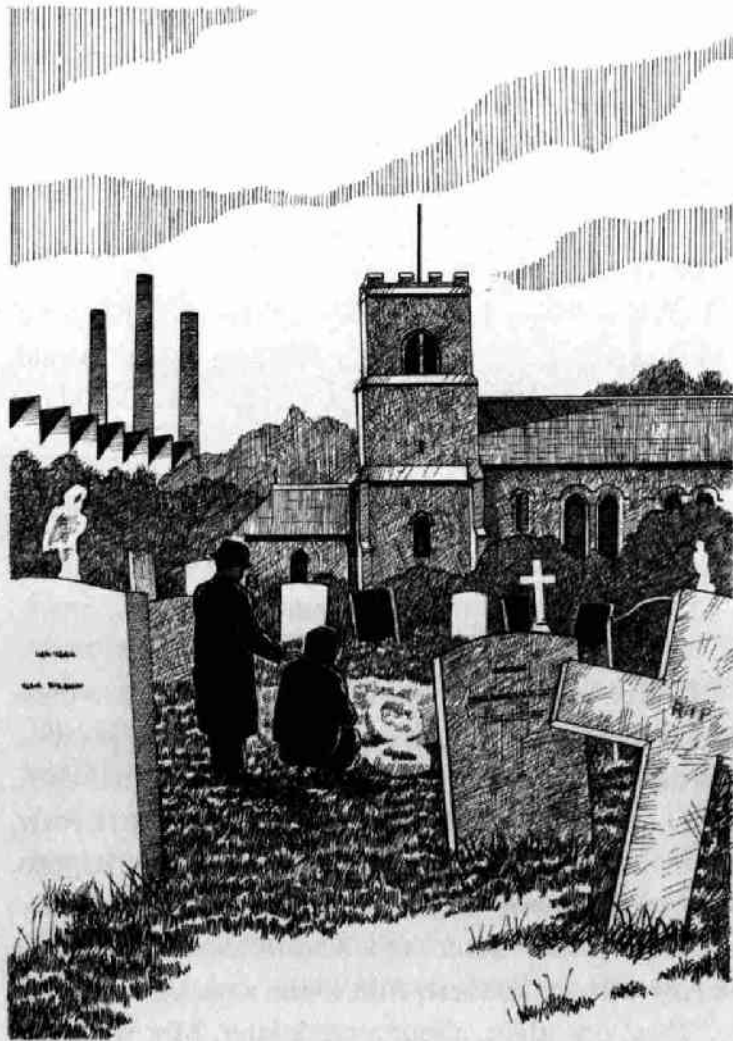
The two old people said goodbye to their dead son.

window and she watched and waited for her son. He did not come and she began to cry quietly.