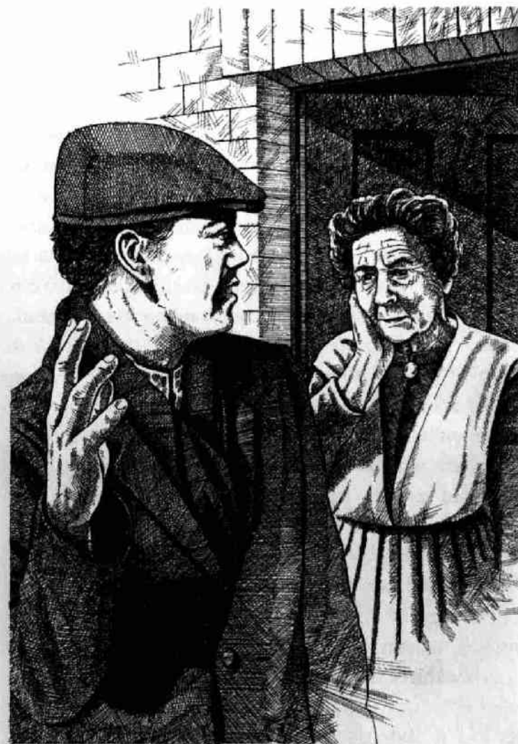
Mrs White stood at the door for some time.

Herbert left the house and walked quickly down the road. His mother stood at the door for some time and watched him. The winter sun was warm, but suddenly she felt very cold.