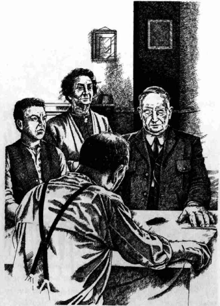
'The monkey's paw brings unhappiness with it.'

'What do I do now?' he asked his friend.