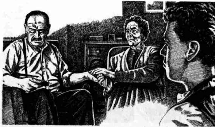
'I wish for £30,000.'

Herbert stopped talking and his old father thought for a minute. The room was quiet and they could hear the rain on the windows.