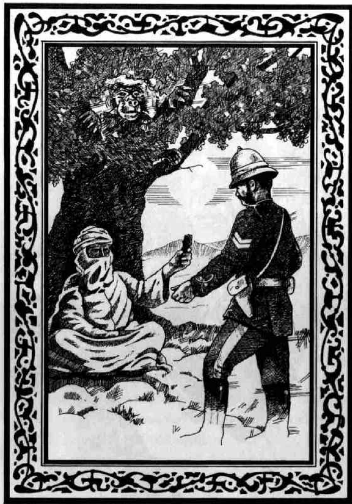
'An old Indian gave the monkey's paw to one of my friends.'

in India I saw many strange things.' He stopped talking for a minute and then he said, 'This monkey's paw can do strange and wonderful things. An old Indian gave the paw to one of my friends. My friend was a soldier too. This paw is magic because it can give three wishes to three people.'