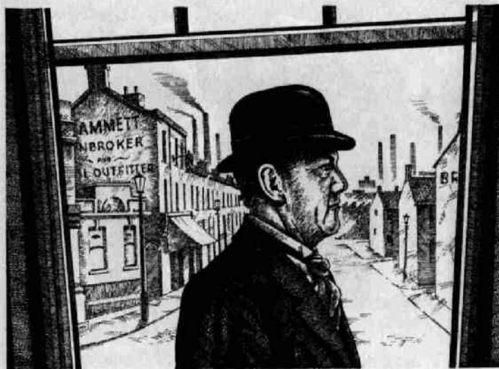
‘There’s a tall, well-dressed stranger in front of our house.’

‘There’s a man in front of our house,’ Mrs White answered. ‘He’s a stranger – very tall – and well dressed.