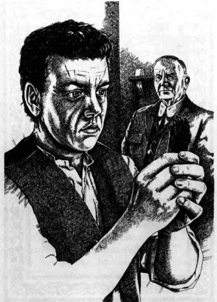
Herbert looked carefully at the monkey's paw.

Herbert laughed again, but the soldier said, 'Don't laugh, boy. Remember, you're young. I'm old now and