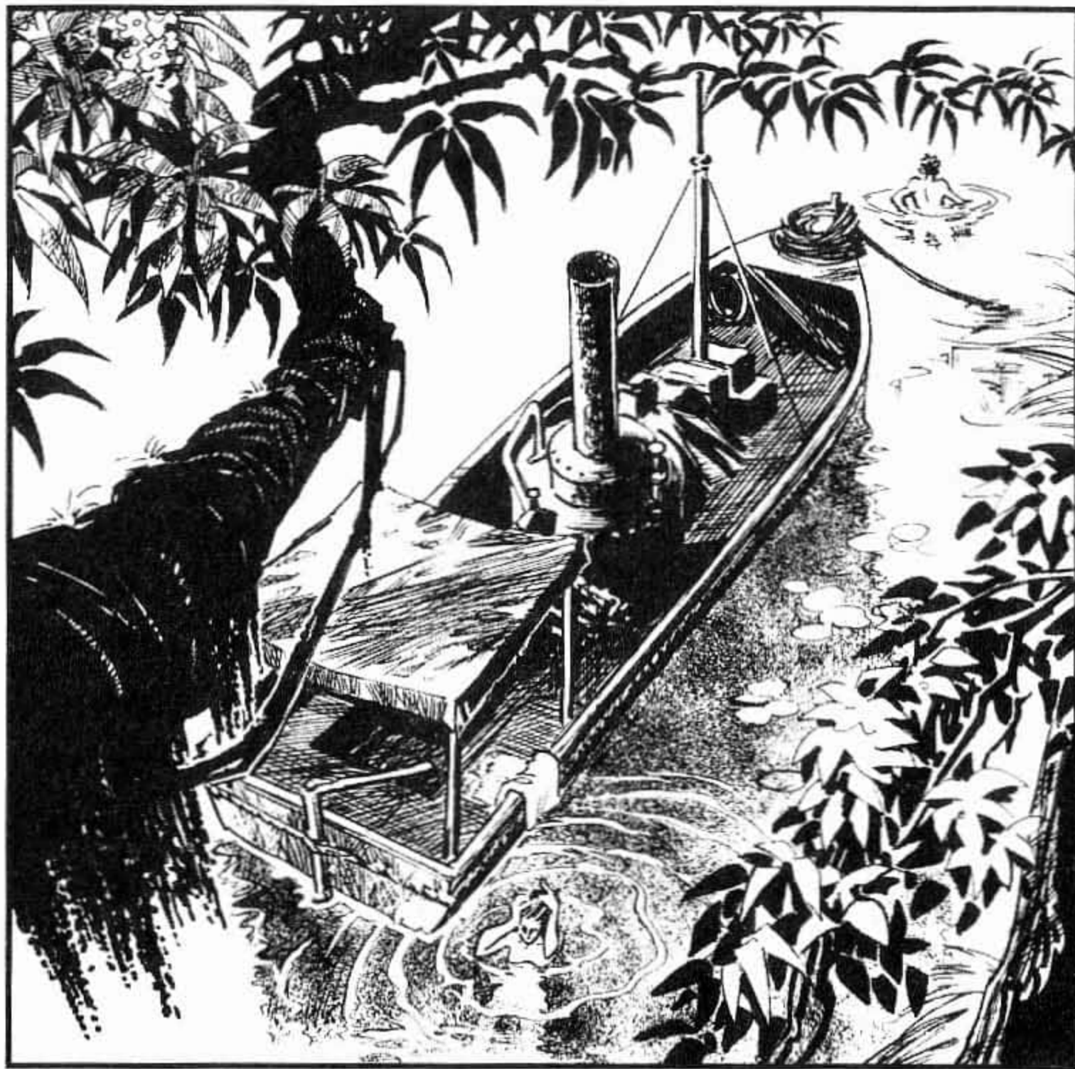
The water felt wonderfully cool on Rose's hot skin.

'No,' said Rose sharply. Her brother had spoken so often about the terrible effects of strong drink, but he had failed to