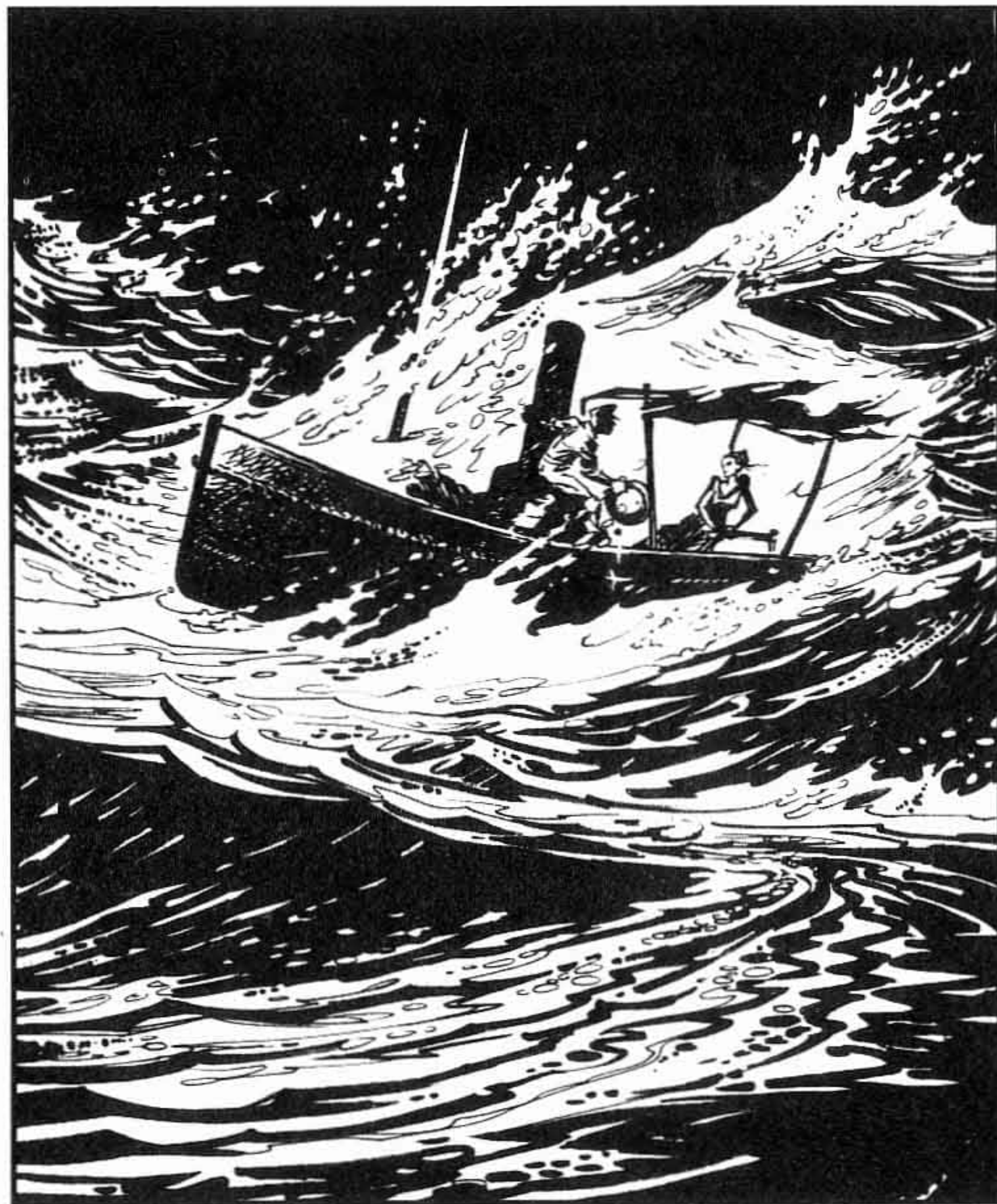
Rose fought with the tiller, and Allnutt rushed back to help her.

The African Queen went down, and the brave attempt to torpedo the Königin Luise for England failed. As the old boat disappeared under the waves, the storm died away and soon the waters of the lake were once more smooth and calm.