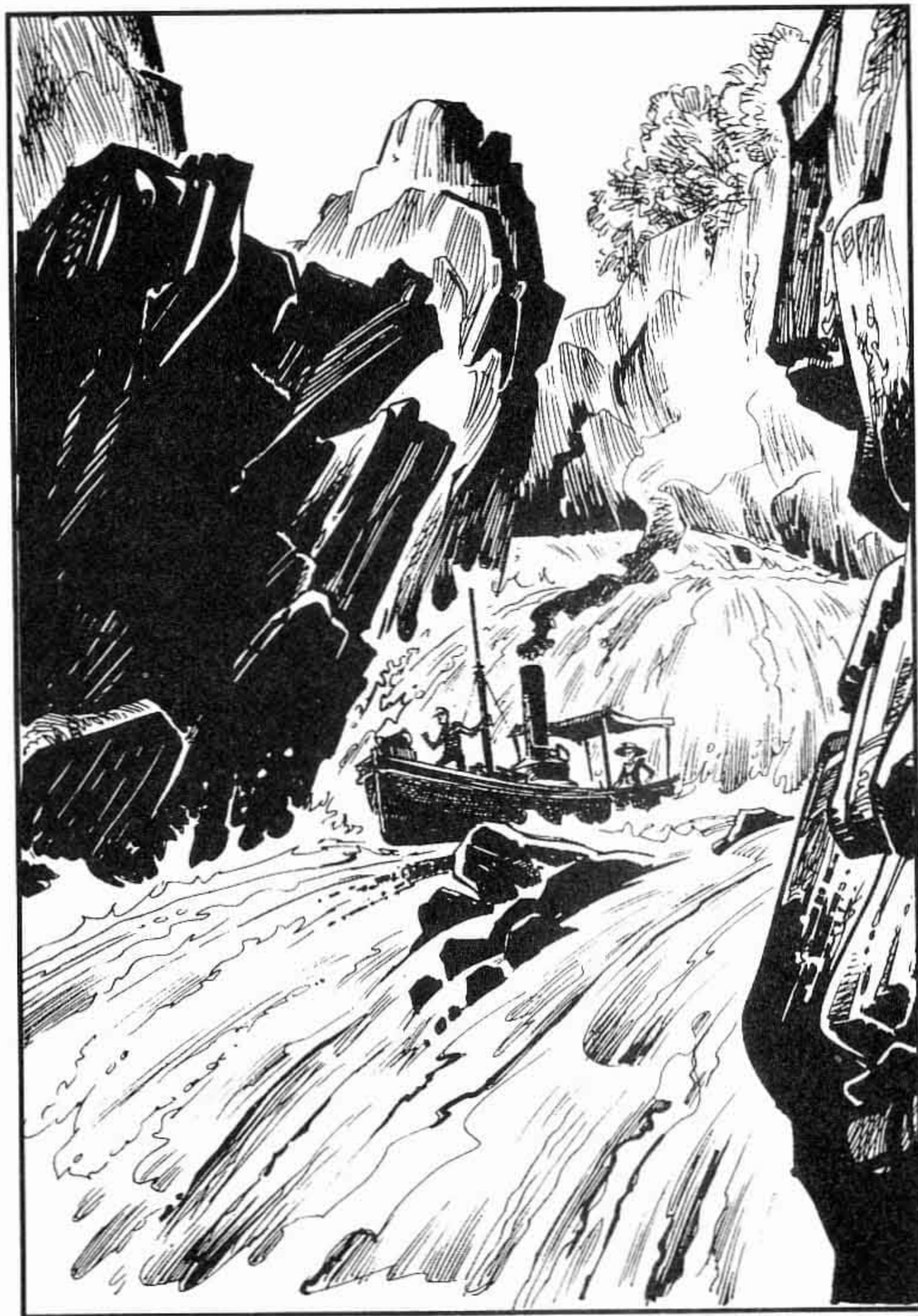
Rose rode the rapids like a queen of the sea.

work with fear in his heart. For the first time since he left school, he was saying his prayers.