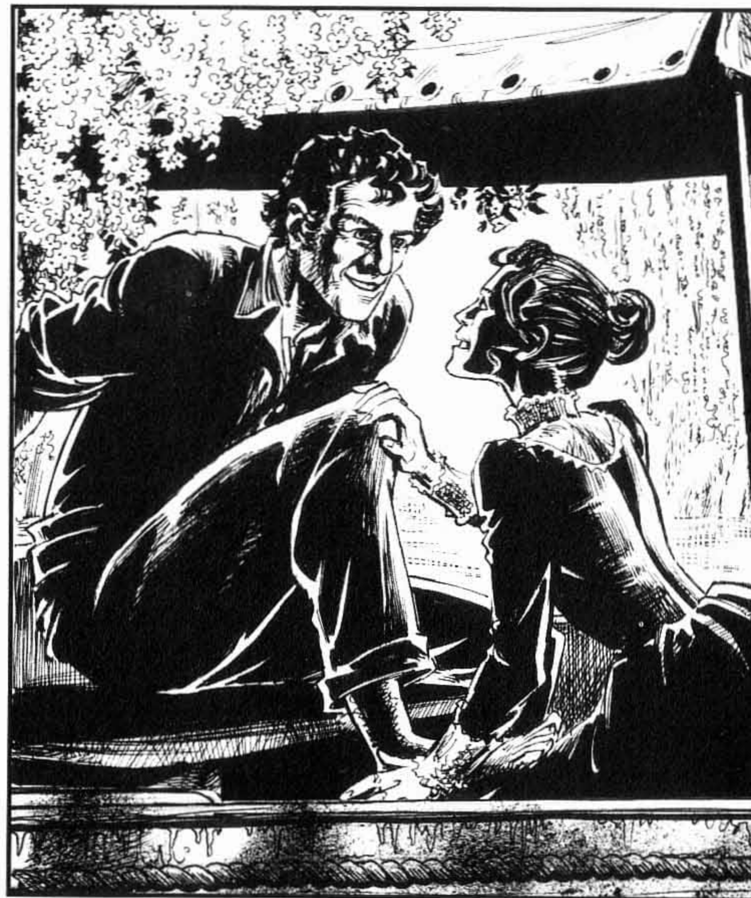
It was impossible not to think of love, surrounded by the wild beauty of the Ulanga.

careless and untidy, unable to cook a meal or clean a room. These ladies explained to Rose that women had to spend all their time clearing a path for men in life, but at the same time, men were like gods, and must be loved and obeyed.