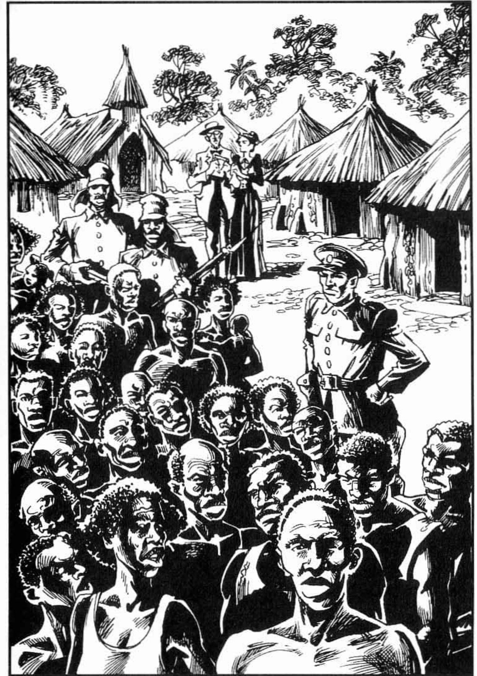
The German soldiers had taken all the villagers away.

'Oh God,' he prayed, 'help men to see that war is not the answer to their problems. Bring them, in the end, to a lasting peace. And God, look kindly on our brave country, England. Carry her safely through this most difficult time, and give her victory over the godless ones who are responsible for this disaster!' As he finished his prayer, Samuel sounded almost like a fighting man, and Rose had never admired her brother more. Tears fell through her fingers as she covered her face