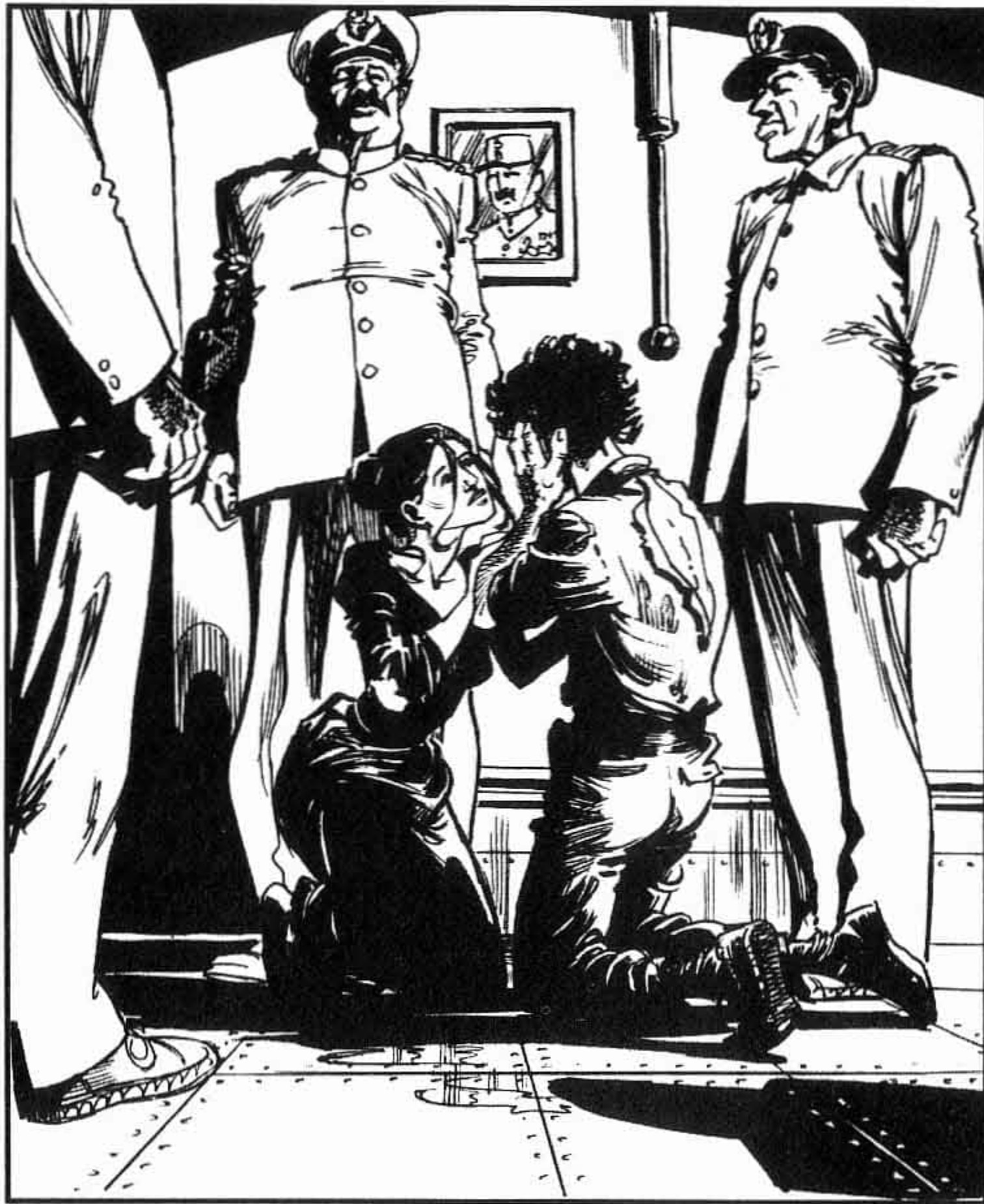
Rose went to Allnutt at once and knelt in front of him.

on his own ship. And in no time at all he had decided exactly what he was going to do with his prisoners.