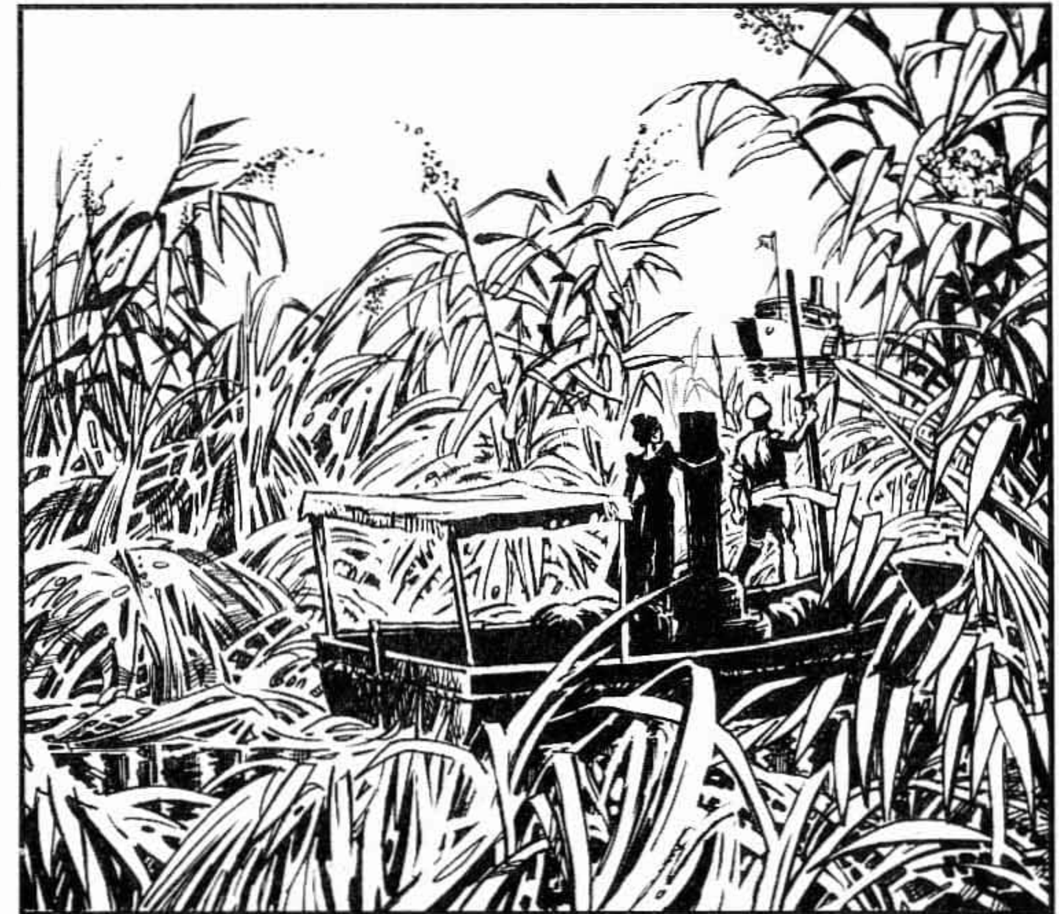
They watched the Königin Luise from their hiding-place.

'Look, they're going a different way now!' said Rose