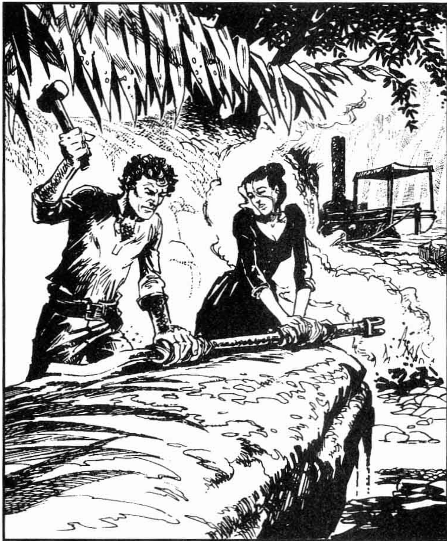
It was a week of back-breaking and dangerous work.

Rose was so full of hope, and so sure that Allnutt could do it that in the end he agreed to try. He put his doubts to one side, and they started almost a week of back-breaking, and