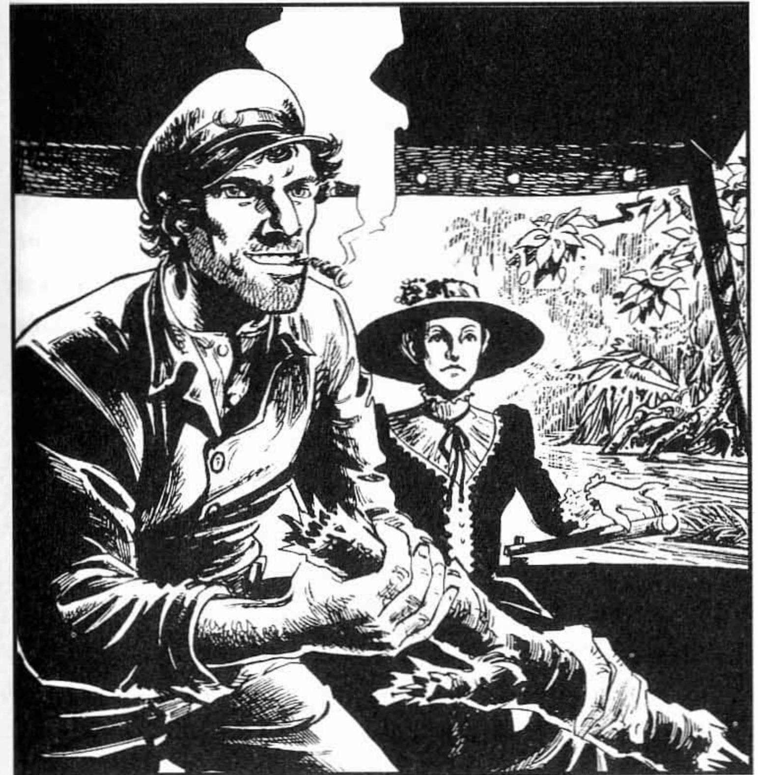
Allnutt kept a careful eye on the river ahead.

Rose silently took hold of the tiller; it was so hot that it seemed to burn her hand. She began to enjoy feeling the boat move obediently as she put the tiller to one side or another, while Allnutt put more wood on the fire, and kept a careful eye on the river ahead. Plants grew thickly on the muddy bed