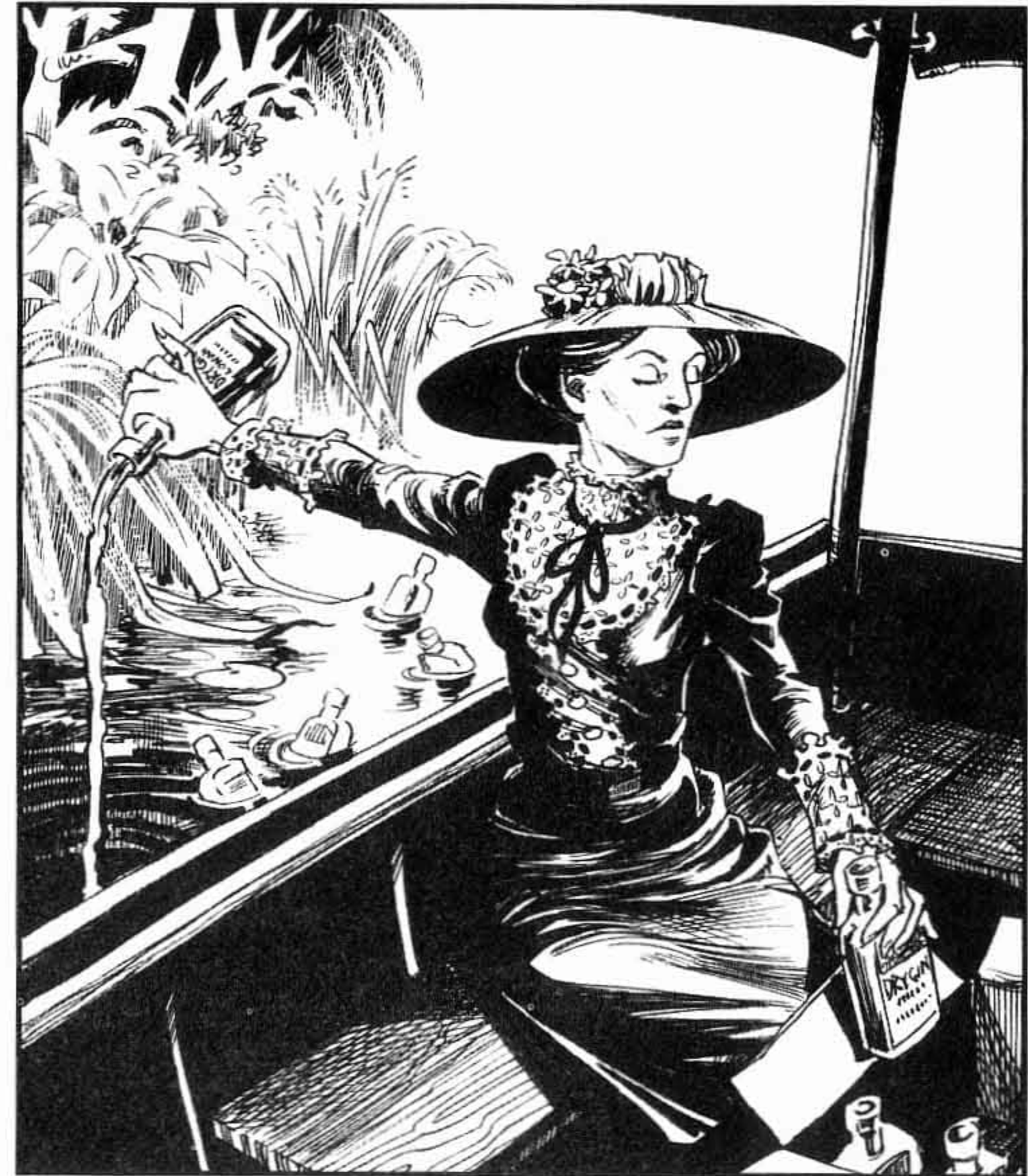
Rose was emptying all the gin bottles over the side of the boat.

Rose went on calmly with her sewing, while Allnutt spent some time repairing the boiler and the engine. But when he had washed all the oil off himself, there was nothing left to do. And all round him was the silence of the river, which in itself was enough to make him feel lonely and uncertain.