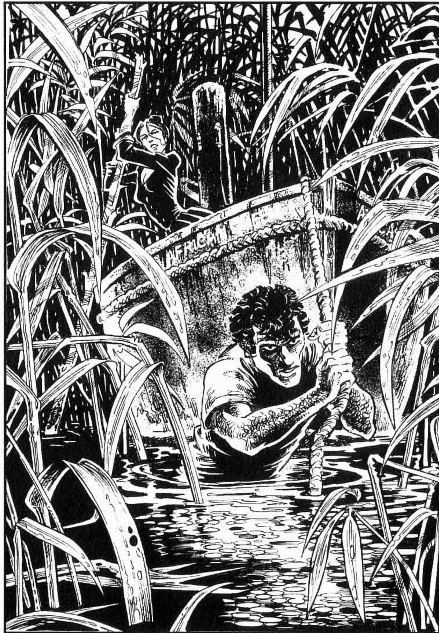
Allnutt tried to pull the boat along behind him.

‘All right,’ said Rose. ‘Give me the boat hook.’