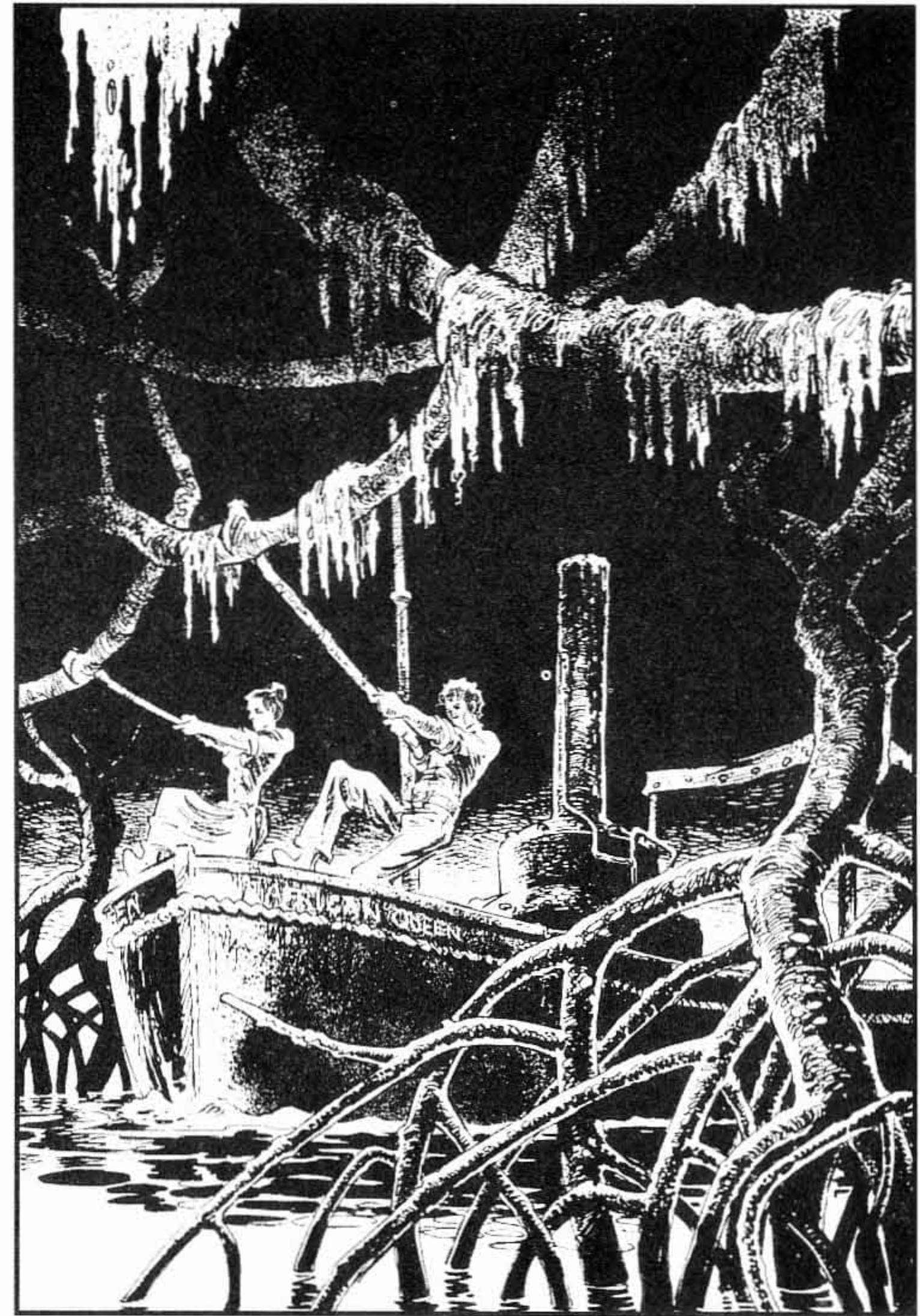
They lost all count of time in that dark mangrove swamp.

Then the channel took another turn, and in front of them was a view in which there were almost no mangroves.