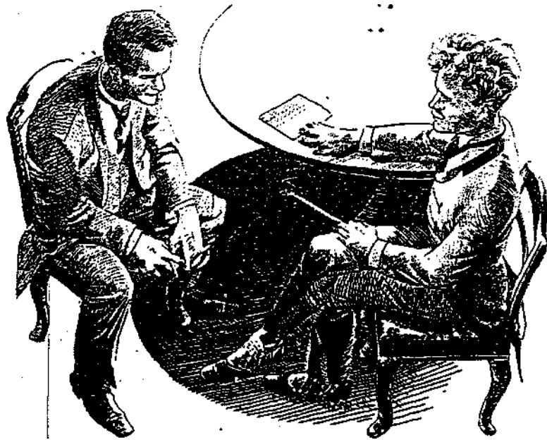
'Alan, in a locked room upstairs there is a dead body. I want you to destroy it.'

'Yes, Alan, it is. Please sit down.' Across the table the two men's eyes met. Dorian was silent for a moment; then, very quietly, he said, 'Alan, in a locked room upstairs there is a dead body. I want you to destroy it. There must be nothing left . I know you can do this.'