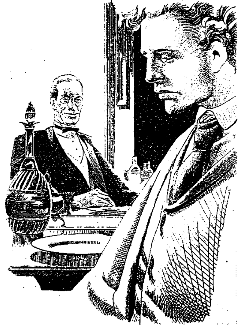
'Tell me how you have kept your youth and your wonderful beauty, Dorian,' said Lord Henry.

For a while the two men were silent. Then the older man lay back in his chair and looked at Dorian with half-closed eyes, 'Tell me how you have kept your youth and your wonderful beauty, Dorian. You must have some secret. I'm