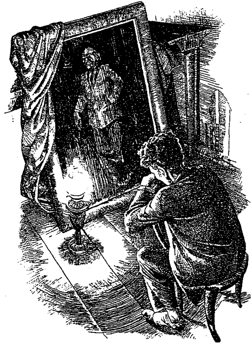
As time passed, the face in the picture grew slowly more terrible.

But behind the locked door at the top of the house, the picture of Dorian Gray grew older every year. The terrible face showed the dark secrets of his life. The heavy mouth, the yellow skin, the cruel eyes - these told the real story. Again and again, Dorian Gray went secretly to the room and looked first at the ugly and terrible face in the picture, then at the beautiful young face that laughed back at him from the mirror.