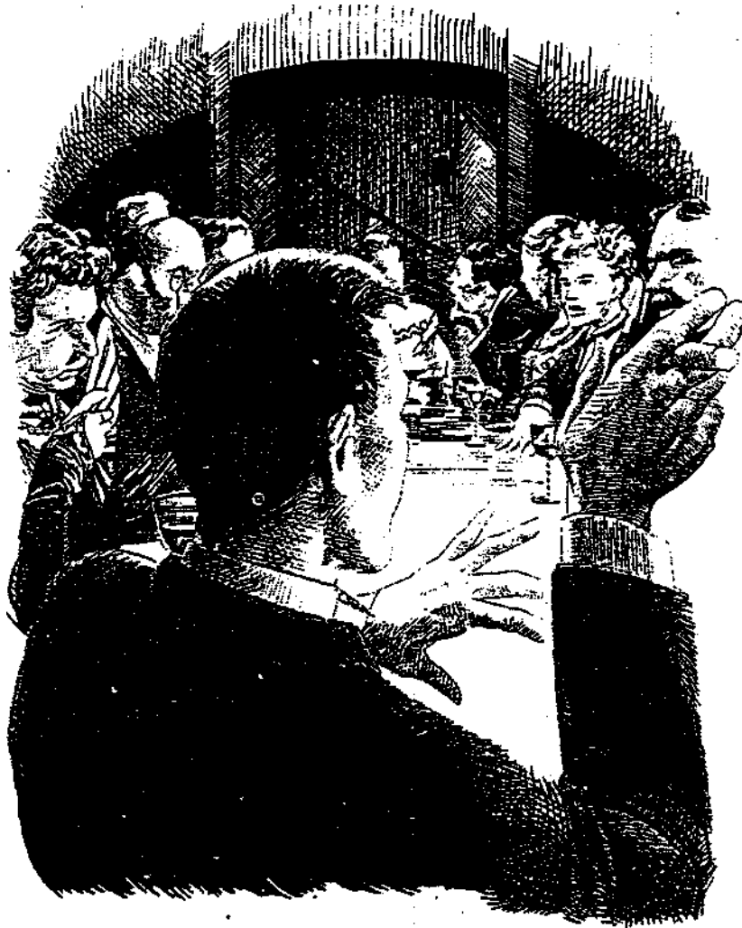
Dorian Gray never took his eyes away from Lord Henry.