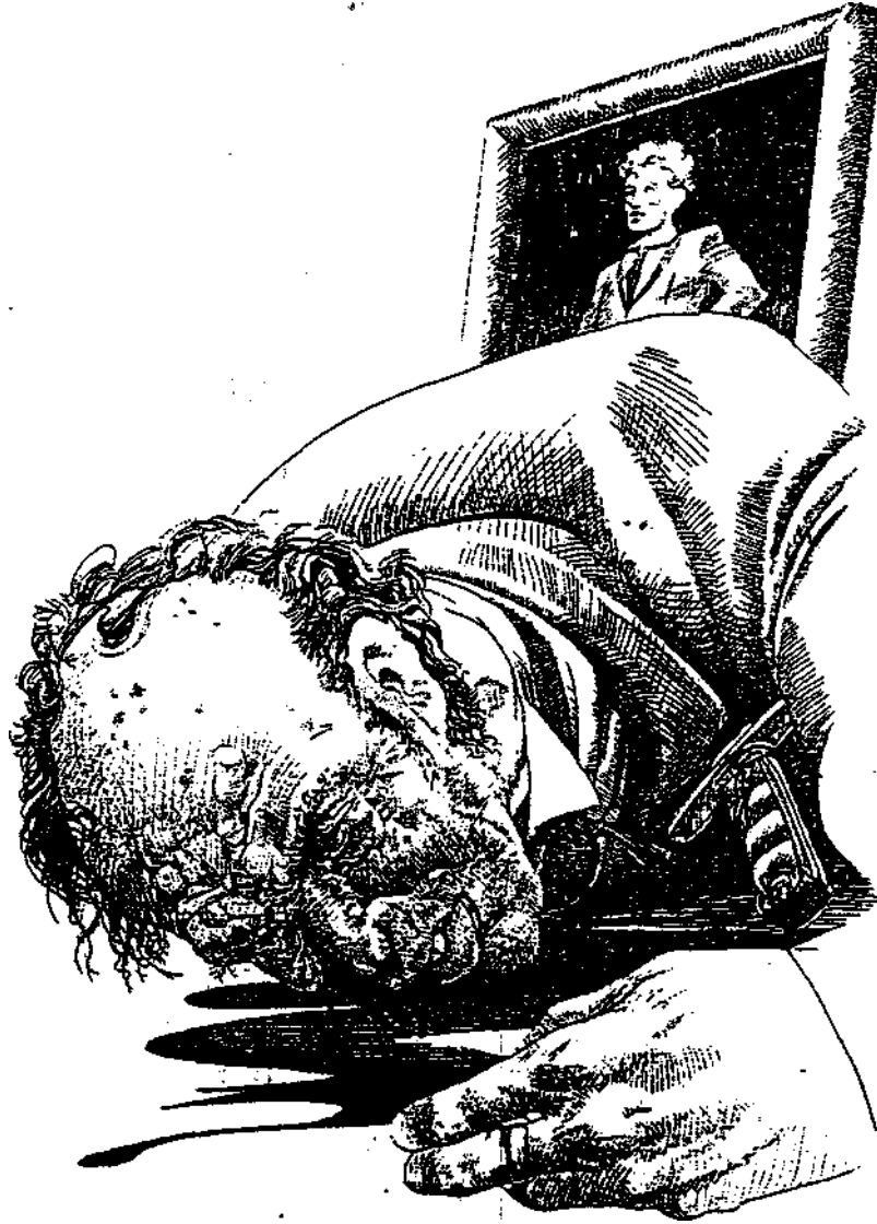
Lying on the floor was a dead man, with a knife in his heart.