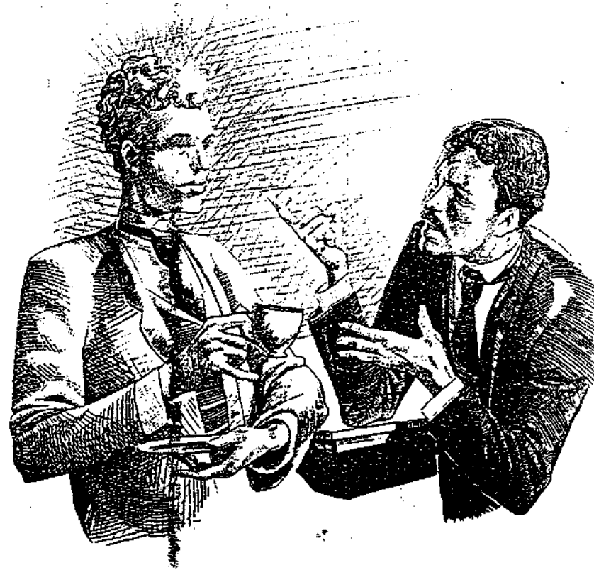
'You went out to dinner when Sybil Vane was lying dead in some dirty theatre?' asked Basil.

'Stop, Basil! I won't listen to you!' Dorian jumped to his feet. 'Sybil Vane is in the past . . . finished . . . forgotten.'