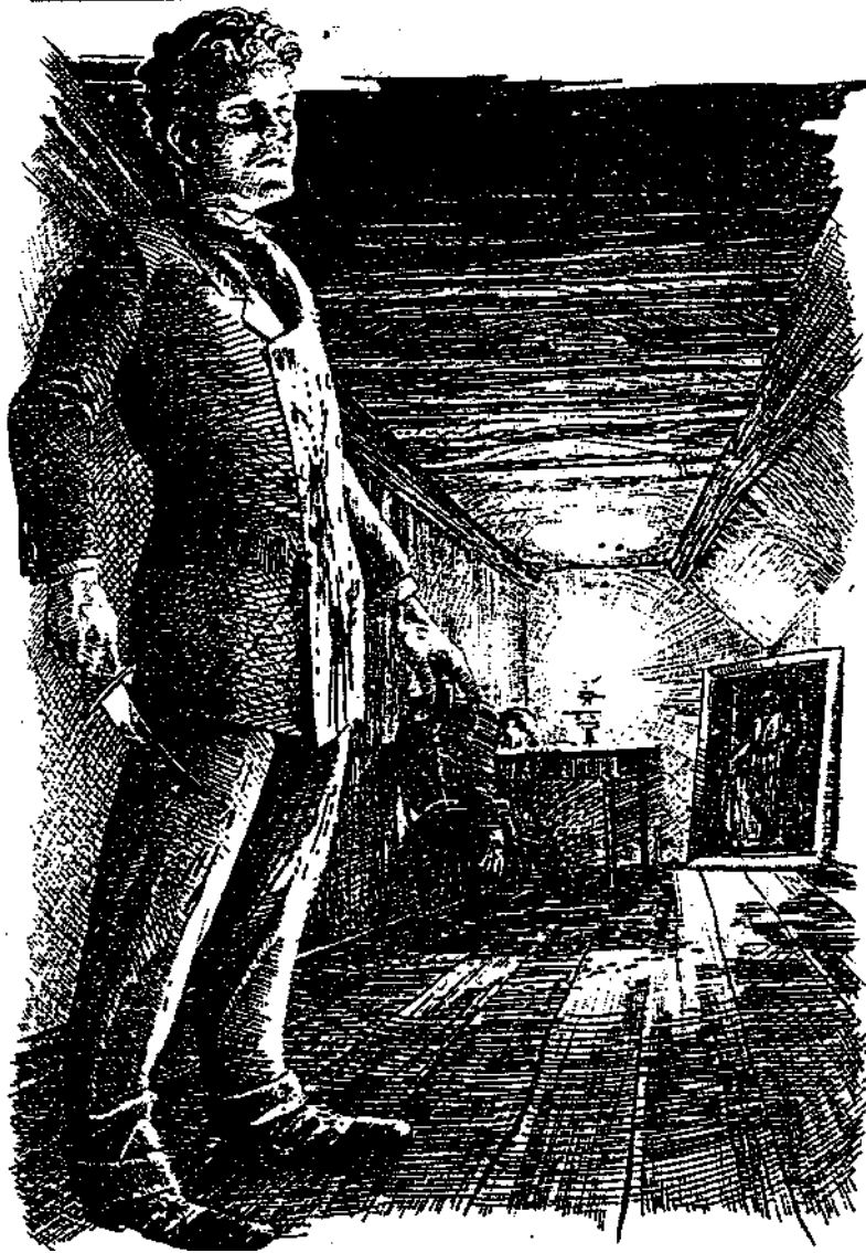
Dorian stood and listened. He could hear nothing — only the drip, drip of blood onto the floor.

again. The murdered man's head fell forwards, and the blood ran slowly across the table, and down onto the floor.