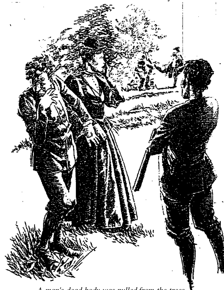
A man's dead body was pulled from the trees.

There were shouts and calls from the men, and then a man's body was pulled from the trees. Dorian turned away in horror. Bad luck seemed to follow him everywhere.