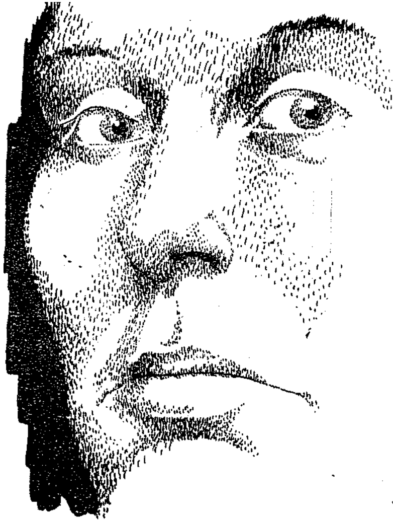
The portrait had really changed. There was something unkind, cruel about the mouth. It was very strange.